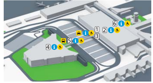
Access and car park